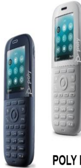
POLY ROVE 30 and 40